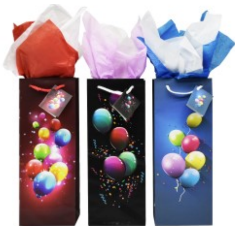
BG-90-1 Balloons and Confetti (Hold 1 Bottle) 24/Case Qty. to Order TEMPORARILY SOLD OUT