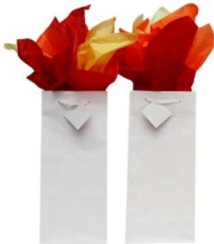
BG-04-W-1 Classic White Matte (Hold 1 Bottle) 24/Case Qty. to Order ____