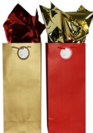
BG-78-2 Classic Matte Red and Gold (Hold 1 Bottle) 24/Case Qty. to Order ____