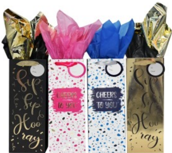
BG-03-1 Sip Hooray & Cheers w/ Hot Foil Stamp (Hold 1 Bottle) 24/Case Qty. to Order _____