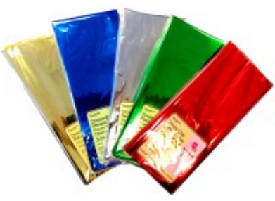
Foil Tissue Paper In Individual Colours & Rainbow Packs 20" x 20" 3 Sheets/Pack 5 Colours Available $1.29 ea. See Order Form for choices