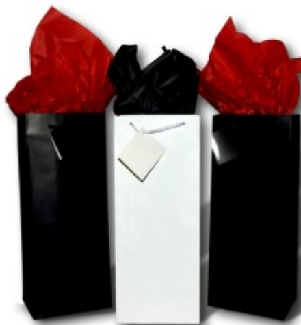
BG-04-BW-2 12 Black & 12 White (Hold 1 Bottle) 24Case Qty. to Order ____