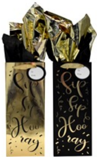
BG-02-1 Sip Sip Hooray w/ Hot Foil Stamp (Hold 1 Bottle) 24/Case Qty. to Order TEMPORARILY SOLD OUT