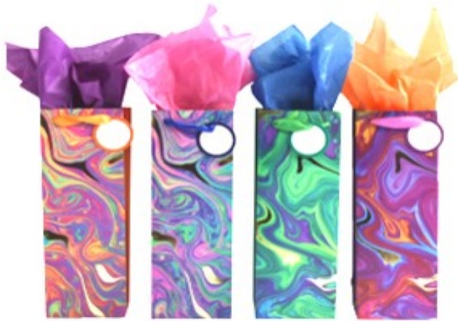
BG-74-1 Matte Paint Swirl with Hot Foil Stamp (Hold 1 Bottle) 24/Case Qty. to Order ____