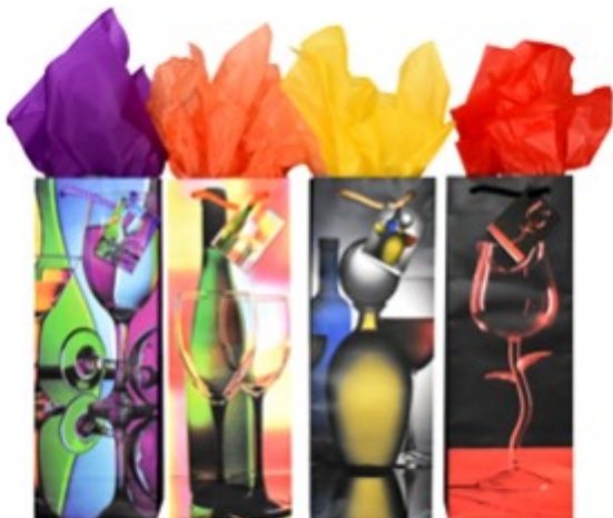
BG-62-1 Bright Sculpturesque Glasses (Hold 1 Bottle) 24/Case Qty. to Order ____