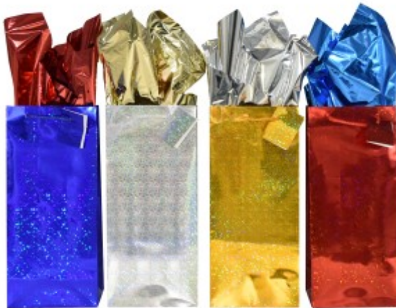
BG-08-2 4 Metallic Colours (Holds 2 Bottles) 24/Case Qty. to Order _____