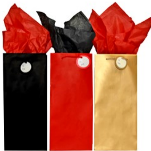
BG-79-2 Classic Matte Red, Gold, and Black (Holds 2 Bottles) 24/Case Qty. to Order ____