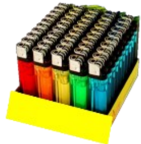
Lighters In Counter Top Display Tray - 50 Pack $49.95/Pack