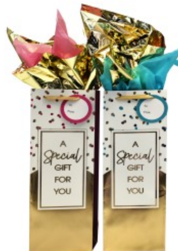
BG-09-1 Special Gift Saying w/ Hot Foil Stamp (Hold 1 Bottle) 24/Case Qty. to Order _____