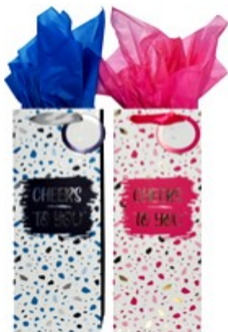
BG-72-1 Pink & Blue 'Cheers to You' (Hold 1 Bottle) 24/Case Qty. to Order ____