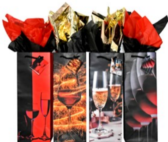
BG-24-1 Chic Red/Black Glasses Foil Stamp (Hold 1 Bottle) 24/Case Qty. to Order ____