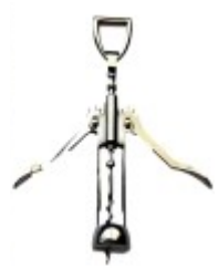
Winged Cork Screws with Zink Alloy 12/Case $4.29 Ea. _____