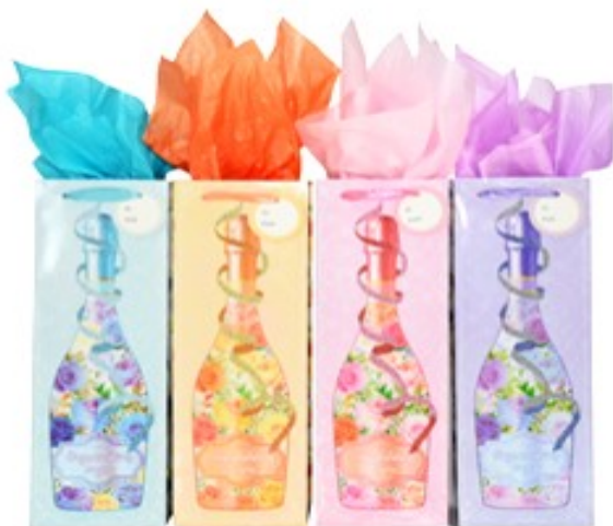
BG-10-2 Congratulations Pastel Floral (Hold 2 Bottles) 24/Case Qty. to Order ____