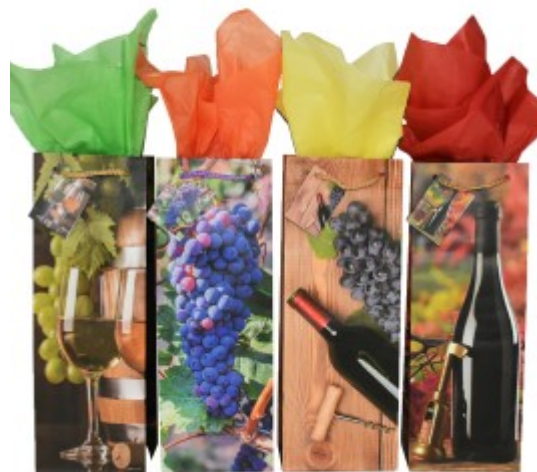
BG-86-1 Classic Wine & Grapes Vineyard (Hold 1 Bottle) 24/Case Qty. to Order ____