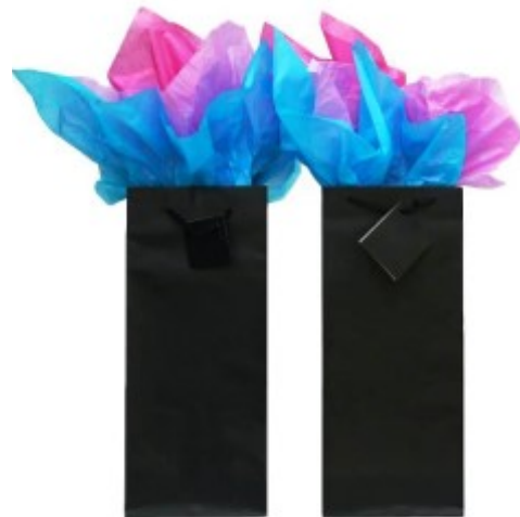
BG-04-BL-1 Classic Black Matte (Hold 1 Bottle) 24/Case Qty. to Order ____