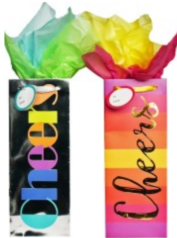
BG-69-1 Silver & Gold Cheers w/ Foil Stamp (Hold 1 Bottle) 24/Case Qty. to Order ____