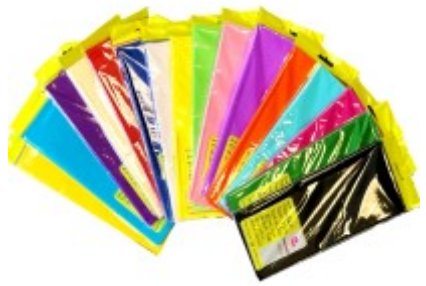
Tissue Paper In Individual Colours & Rainbow Packs 20" x 20" 10 Sheets/Pack 16 Colours Available $1.29 ea. See Order Form for Choices